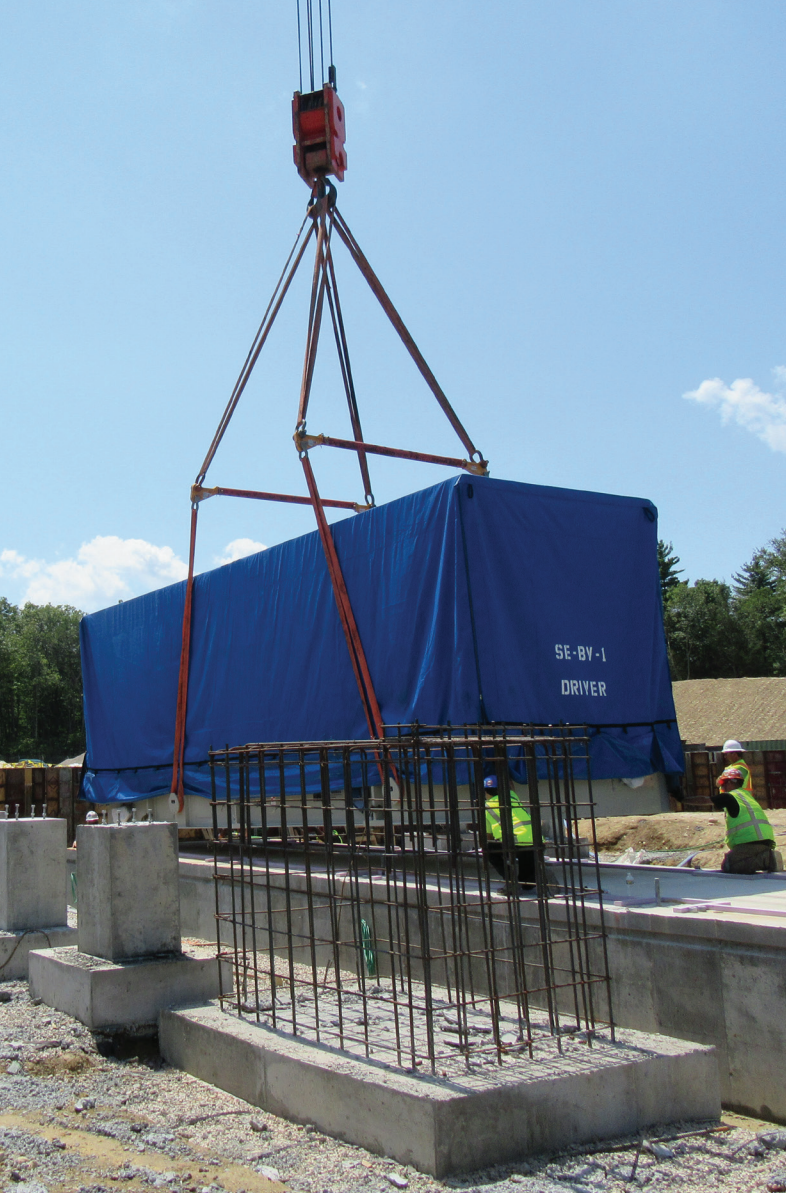
SPECTRA ENERGY BURRILLVILLE COMPRESSOR STATION

BOND was selected to work on the station upgrade as part of a pipeline expansion project to bring more natural gas to New England and ease the region's energy crisis. The project scope centered around the addition of a new Solar Turbine Mars 100 unit at an existing facility.